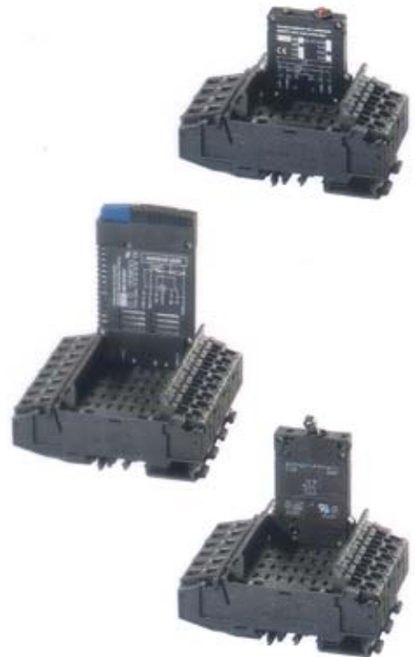
The Module 17plus provides ease of combination with numerous E-T-A products.