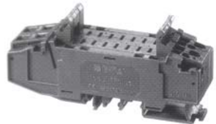
Power Distribution System Module 17plus